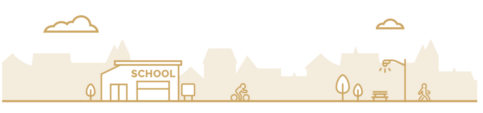
version 1.3 – August 2020